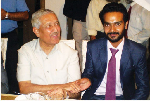
Discussion on Old Age Home Project during the dinner with Honorable Dr. Abdul Qadeer Khan (National Hero and Pride of Pakistan)