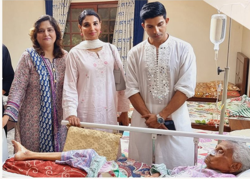
MOHSIN ABBAS Actor