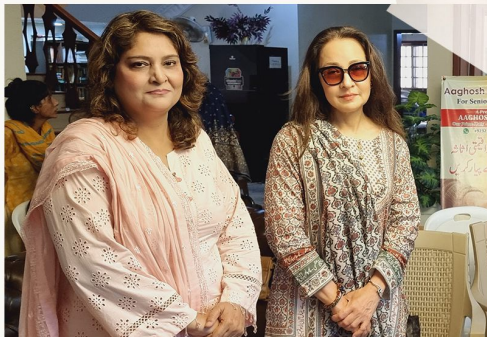
ZEBBA BAKHTIAR Actress