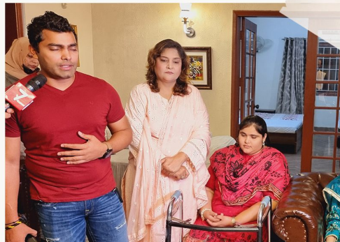
UMAR AKMAL Cricketer